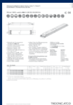
Data sheets available at www.tridonic.com , "Technical Information" menu