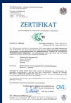
Certificates at www.tridonic.com , "Technical Information" menu